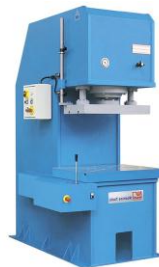
Press variety kind of sample