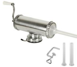
Pressing sausage and cut